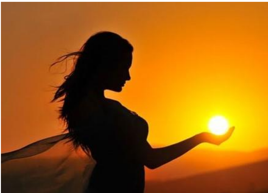
Holding the Sun by Kililani Mahi.

April 27, 2025 10:00 AM 2700 L Street Sacramento, CA 95816